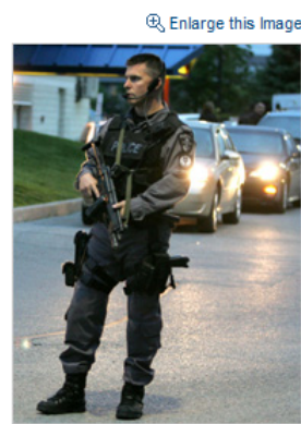
A police officer stood guard in Pickering, Ontario, on Friday.

MISSISSAUGA, Canada , June 4 — Several of the people arrested by Canadian authorities in a huge counterterrorism sweep over the weekend regularly attended the same storefront mosque in a middle-class neighborhood of modest brick rental townhouses and well-kept lawns.