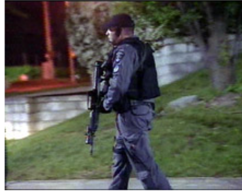
Officers surrounded a police station in Pickering, east of Toronto, where the suspects were brought shortly after their arrests.